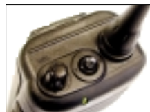
IC-F21S Toggle type radio