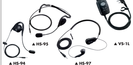
▲ HS-94 ▲ HS-95 ▲ HS-97 ▲ VS-1L

HS-94 : Earhook headset with flexible boom microphone. HS-95 : Behind-the-head headset with flexible boom microphone. HS-97 : Throat microphone fits around your neck and picks up speech vibration. VS-1L : PTT/VOX unit. Required when using these headsets with the transceiver.