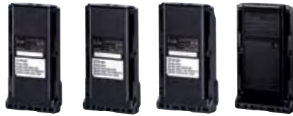
▲ BP-230 ▲ BP-231 ▲ BP-232 ▲ BP-240