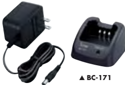
▲ BC-147 ▲ BC-171

BC-171 DESKTOP CHARGER + BC-147 AC ADAPTER Charges the battery pack in 8–10 hours (approx.). Coming soon.