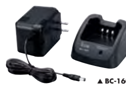
▲ BC-145 ▲ BC-160

BC-160 DESKTOP CHARGER + BC-145 AC ADAPTER Charges the BP-231 in 2 hours (approx.). BC-119N + AD-106 + BC-145 is also available. : Charges the BP-231 in 2 hours (approx.).