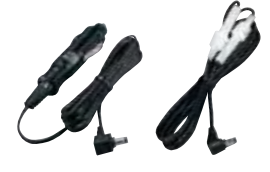
▲ CP-17L ▲ OPC-515L

CP-17L CIGARETTE LIGHTER CABLE, OPC-515L DC POWER CABLE For use with the BC-160 or BC-119N. (12–16V DC required).