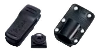
▲ MB-93 ▲ MB-96F

MB-93 : Swivel type belt clip. MB-94 : Alligator type. Same as supplied. MB-96N : Swivel type belt hanger. MB-96F : Fixed type belt hanger.