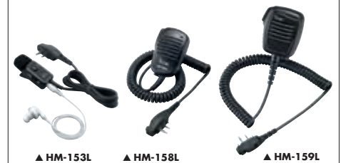
▲ HM-153L ▲ HM-158L ▲ HM-159L

HM-153L : Durable earphone-microphone with revolving clip. HM-158L : Compact and durable body with screw-type connector. HM-159L : Full size durable speaker microphone.