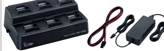
▲ BC-121N+AD-106 (6 pcs.) ▲ OPC-656 ▲ BC-157

BC-121N MULTI-CHARGER + AD-106 CHARGER ADAPTER + BC-157 AC ADAPTER (Six AD-106s are required) Charges up to 6 battery packs in 2 hours (approx.) when BP-231 is attached.