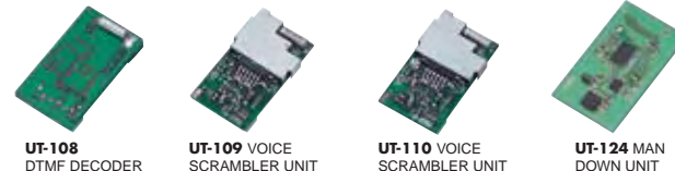
▲ UT-108 DTMF DECODER ▲ UT-109 VOICE SCRAMBLER UNIT ▲ UT-110 VOICE SCRAMBLER UNIT ▲ UT-124 MAN DOWN UNIT

UT-108 : Provides DTMF, Selective call and ANI capabilities. UT-109 : Up to 32 scrambling codes are available. Version 01 is required. UT-110 : Up to 1020 scrambling codes are available. Version 01 is required. UT-124 : Automatically sends an emergency signal when the transceiver is left in a horizontal position for a preset time.