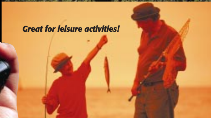
Great for leisure activities!