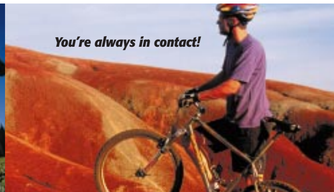
You're always in contact!