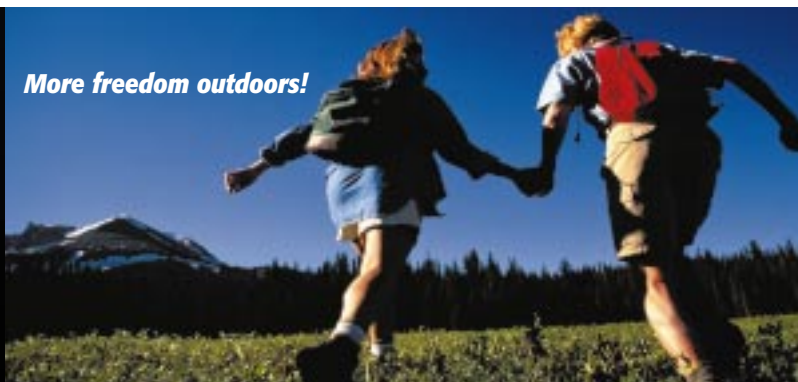
More freedom outdoors!

FreeTalk ® XLS Portable 15-channel GMRS Two-Way Radio TK-3131