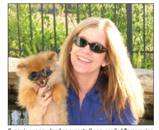
Gypsy is our new (and as expected) very spoiled Pomeranian mascot. Despite the fluffy hairdo, she's all GIRL and does her best to protect Mom at work and at home. So...If you hear some puppy noise in the background, it's probably Gypsy just doing her job.