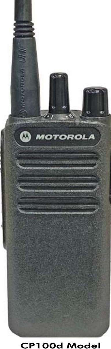
CP100d Model (Replaces CP185)